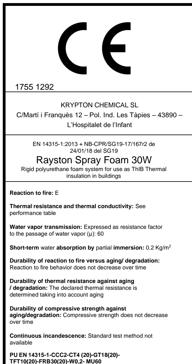
TABLE OF BENEFITS